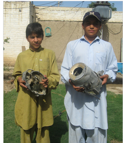
Children in North Waziristan with debris from drone missile.

While the CIA's campaign is well-known and US officials have repeatedly alluded to it, there are also reports of parallel JSOC operations. 66 A Wikileaks cable from October 2009 appears to confirm US Special Forces involvement in drone strikes, with the knowledge and consent of the Pakistani Army. 67 A military intelligence official told the Nation in 2009 that, "[s]ome of these strikes are attributed to . . . [the CIA], but in reality it's JSOC and their parallel program of UAVs strikes." 68 According to one account, JSOC carried out three drone strikes in Pakistan under the Bush Administration before being pulled out in response to public outcry and the concerns of the US ambassador to Pakistan. 69 Other reports suggest that JSOC's role in Pakistan has been limited to providing intelligence for drone strikes conducted under CIA authority. US officials maintain that Special Operations Forces in Pakistan have been present only to train Pakistani forces. 70